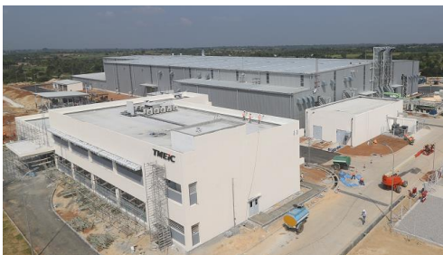
TMEiC motor factory in an industrial area in the State of Karnataka in Bangalore

Demand for industrial infrastructure development is rapidly growing in line with significant economic growth in India. In order to capture this demand and implement the “Make in India” initiative promoted by Prime Minister Narendra Modi, TMEiC has set up a manufacturing base in an industrial area on the outskirts of Bangalore to deliver industrial motors in India. While TMEiC has already established a power electronics (PE) factory, which is also located in the vicinity of Bangalore and is currently fully operating, the motor factory set up at this time has made it possible to deliver motor and drive products in the same way as in Japan in the Bangalore region.