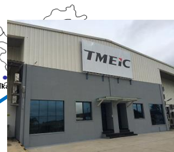
TMEiC PE factory in the State of Karnataka in Bangalore (currently operating)

TMEiC has invested approximately 5 billion yen as the first phase of establishing this motor factory and plans to further invest approximately 2.5 billion yen in fiscal 2016 for realizing sales on a scale of 10 billion yen in five years in fiscal 2020. Additionally, together with product development carried out in advance of the establishment of the motor factory for the TM21G series, which is globally competitive in terms of its compact size, light weight and high efficiency, the Indian factory will roll out a product lineup with a 150kW-23000kW capacity.