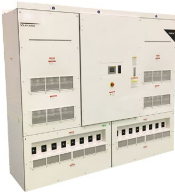
[Reference 1] Image of PVH-L2670E (Output 2.67MVA)